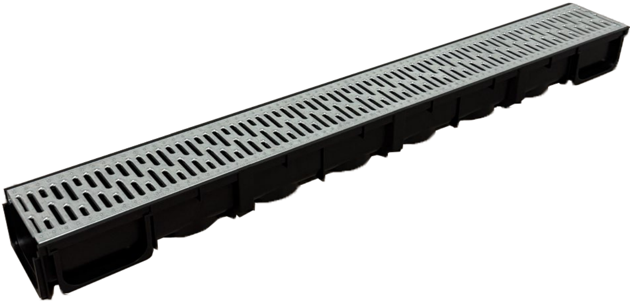
Technical sections of Plastic drain channel with galvanized grating